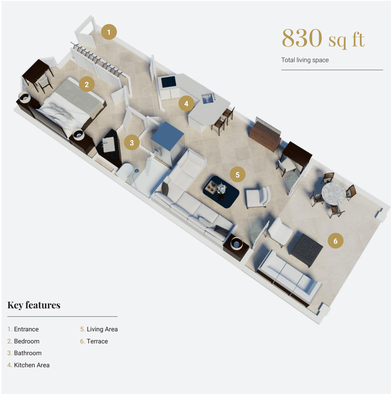
1 Bedroom Apartment